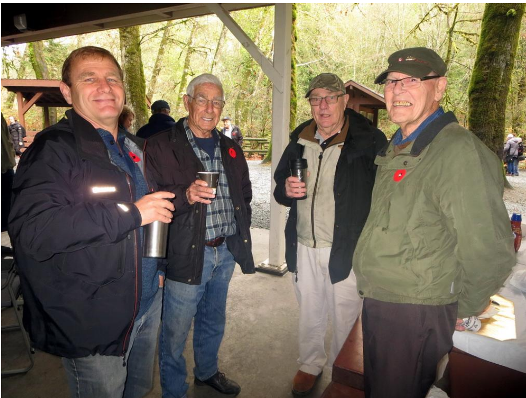
Staying warm with a cup of coffee while waiting for the soup to heat.